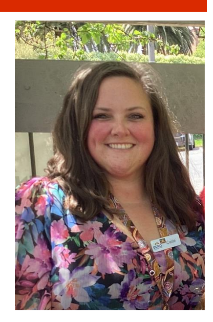
Caitie Support Educator