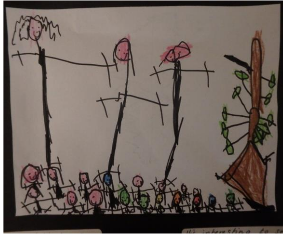
Luka, Aged 5. "My kindergarten"

The children compost their fruit scraps and waste paper, tend vegetable gardens. We harvest rainwater and the pump encourages children to work for and be mindful of water consumption as does the tank gauge.