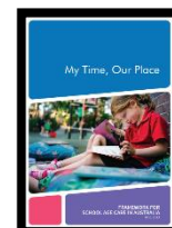
My Time, Our Place; Framework for School Age Care in Australia 2022 V2

Critical reflection: is a meaning-making process that assists informing future practice in ways that demonstrate an understanding of each child’s learning, development and wellbeing and implications for equity and social justice. It involves examining and analysing events, experiences and practices from a range of perspectives to inform future planning and decision-making ( Early Years Learning Framework 2022 V2 – refer to Sources ).