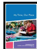
My Time, Our Place; Framework for School Age Care in Australia 2022 V2

Critical reflection: is a meaning-making process that assists informing future practice in ways that demonstrate an understanding of each child’s learning, development and wellbeing and implications for equity and social justice. It involves examining and analysing events, experiences and practices from a range of perspectives to inform future planning and decision-making ( Early Years Learning Framework 2022 V2 – refer to Sources ).