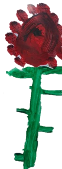
'Anzac Poppy' Artwork by 4-year-old child

Group E (2 x 7.5hr session) – Thursday & Friday, 8.30 – 4.00pm