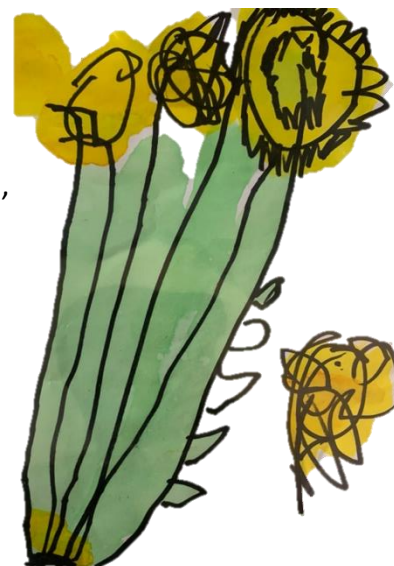
'Daffodils' – Artwork by 3-year-old child

Please note that our parent volunteers do not need a working with children's check provided that the volunteering is in the group with your own child. Staff will fully supervise all volunteers in accordance with our volunteer and visitor policies.