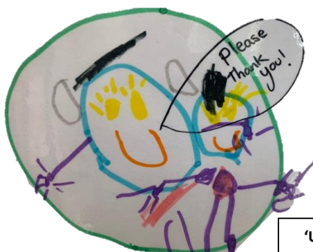
'Use our manners' – Artwork by 4-year-old child

Throughout the kindergarten year we conduct various fundraising opportunities. All funds raised will go towards the kindergarten whether it be purchasing new resources and equipment or maintaining/improving our yard and building. Previous fundraising opportunities we have conducted include raffles, Pie Drives, Picture Product keepsakes, Expression Tea Towels and many more.