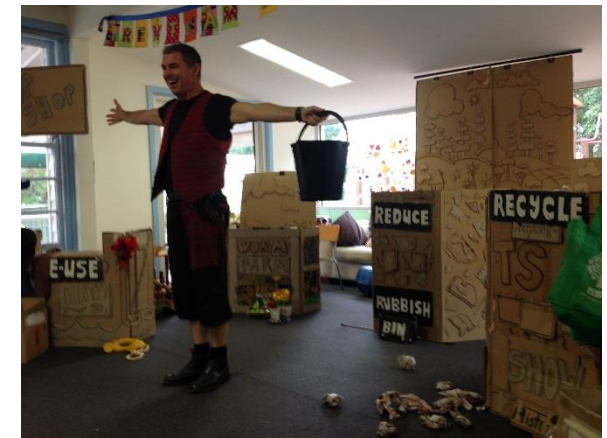
Incursion 2021 – Mr Ants Recycling Show

We have an amazing Parents & Friends Group at Trentham Kindergarten who work together to coordinate fund raising events and support educators to provide a high-quality kindergarten program. Our Parents & Friends Group works with families and the community to raise funds to buy new resources and to fund incursions and excursions throughout the year.